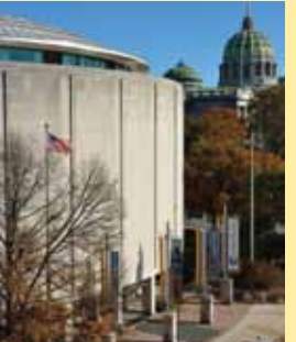
The State Museum of Pennsylvania