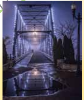
"Walnut St. Bridge" by Jeb Boyd