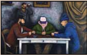
PIGEON'S "A MOMENT OF SILENCE"