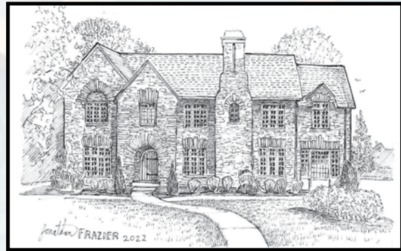
FROM LEFT TO RIGHT: THE HISTORIC HARRISBURG RESOURCE CENTER, THE MANOR

The Art Association will present two Soirées this summer, with The Hall Foundation as the sponsor.