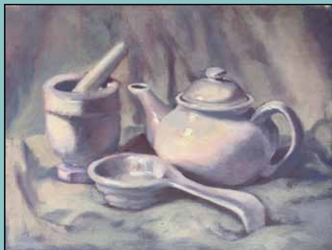
Hanson's "Art Is Hard, Practice Shapes"