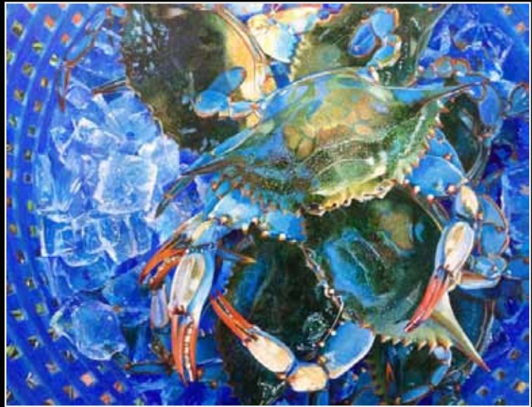
FROM LEFT TO RIGHT: "LIGHT CIRCLE VARIANT" BY PAVOL; "GULF COAST BLUES" BY JOFFRION